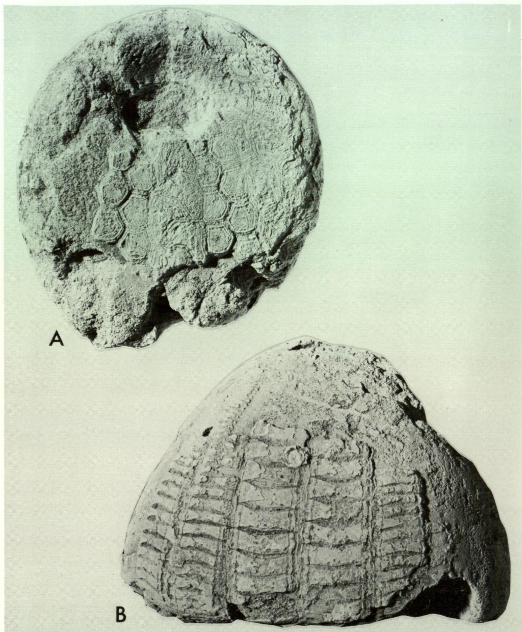
Figure 1 Echinocorys stomias sp. nov., A, holotype, WAM 84.442, adoral surface. Note that the labrum and first ambulacral plates are missing, making the peristome appear slightly larger than its original size. B, paratype, WAM 82.3088, lateral profile; both x1.