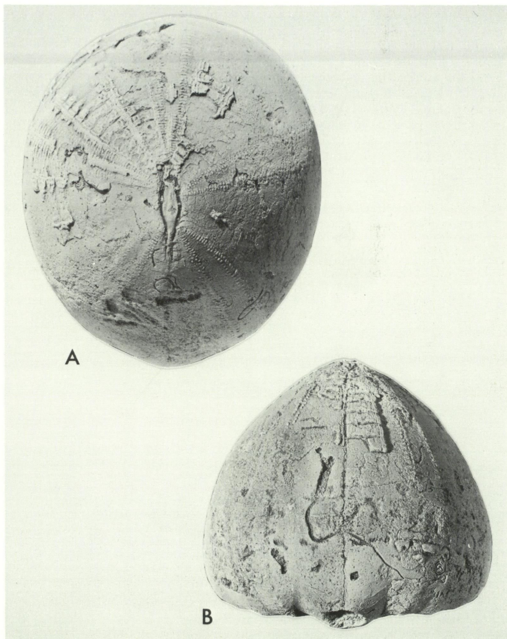
Figure 2 Echinocorys stomias sp. nov., A, paratype, RUCA 20152, aboral surface; B, BS 5.148, posterior view; both x1.